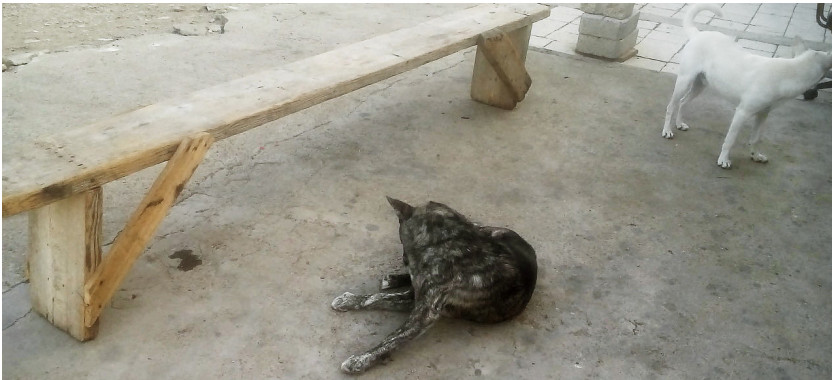
Figure 2. Refugee, the dog. Borgo Tretitoli (Foggia).

The elaboration of their condition as a form of animalisation, a constant refrain for African migrants subjected to forms of violent dehumanisation in agro-industrial enclaves, might be taken as underscoring a discourse of human exceptionalism. Yet, I would argue that the relations which these subjects establish with their nonhuman companions bespeak partially alternative conceptualisations that do not square with the dominant forms of the human that also exclude them. One specific interaction crystallised this potential for me, during a visit I paid to a household that hosts several workers (both men and women) in a hamlet in the district of Foggia. Entering the fenced courtyard I and my fellow visitors were greeted by a small, grey-and-white furred dog, whose «owner», the household head and the senior figure in the whole settlement, immediately proceeded to call off as an act of courtesy, in order to deliver us from a supposed encumbrance: «Refugee!» he shouted. Stunned by the appellation, I inquired about the choice of name for the dog. «One day he appeared into the courtyard», his human friend explained, «and wouldn't leave. So after some time, we decided to give him five years and let him stay». Ample laughter followed from all sides.